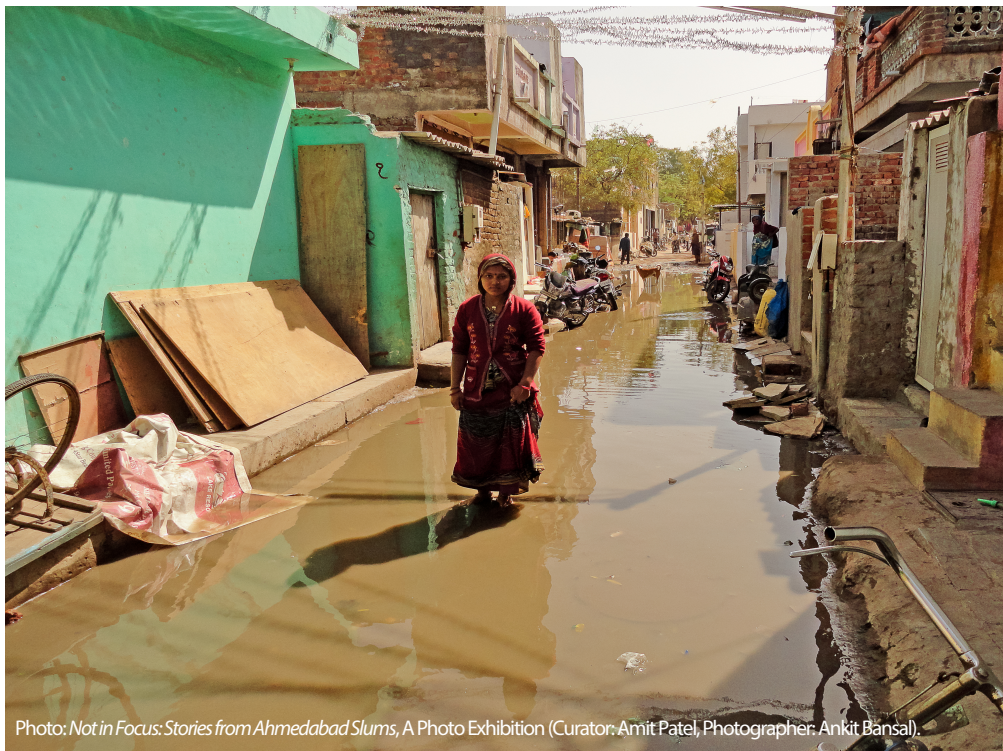
Photo: Not in Focus: Stories from Ahmedabad Slums , A Photo Exhibition (Curator: Amit Patel, Photographer: Ankit Bansal).