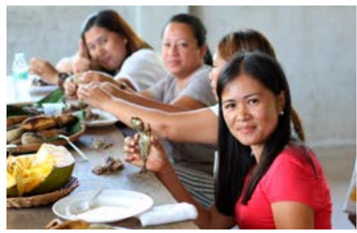
WOMEN SHARE A MEAL AT THE ALBUERA EMPOWERED WOMENS ASSOCIATION'S SMOKED FISH CENTER IN A TYPHOON HAIYAN-AFFECTED COMMUNITY.