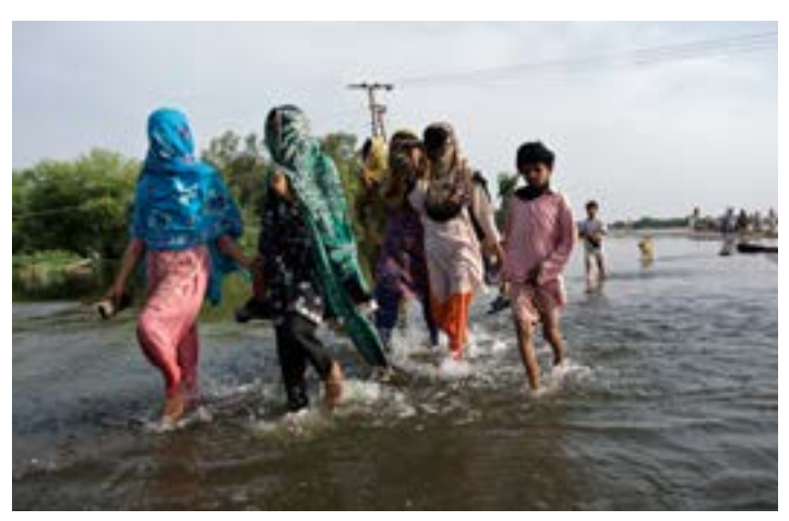
VILLAGERS DISPLACED BY FLOODS, WALK THROUGH FLOODWATERS IN THE VILLAGE OF BASEERA NEAR MUZAFFARGARH IN PUNJAB, PAKISTAN.

in an evacuation shelter on days 12 to 19 after Hurricane Katrina revealed that women were four times more likely than men to be diagnosed as having acute stress disorder.<sup>31</sup> Some studies observed that women suffer from psychosocial impacts of disaster displacement to a greater degree than men.<sup>32</sup> This may be a result of anxiety and post-traumatic stress, while at the same time fulfilling gender-based expectations around caregiving for children and older family members.<sup>33</sup>