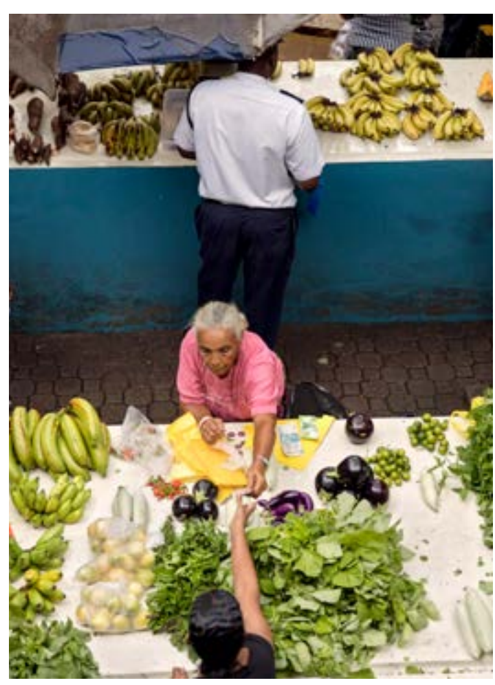
A MARKET VENDOR SELLS PRODUCE AT VICTORIA MARKET IN PORT VICTORIA, SEYCHELLES.