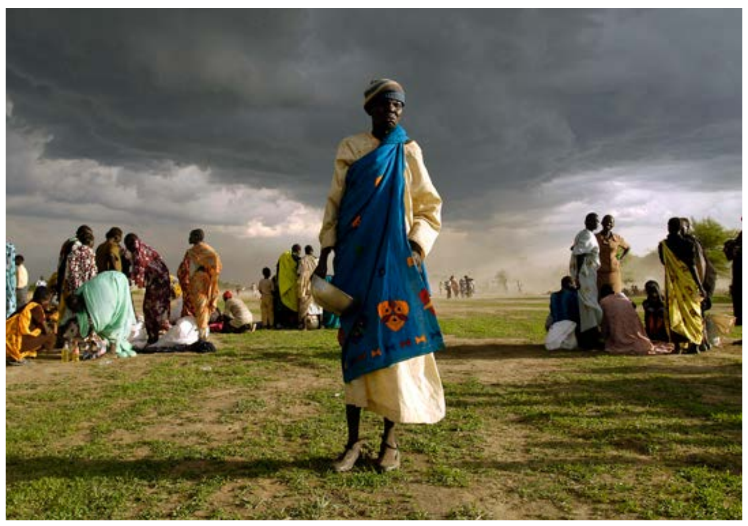
AN ELDERLY WOMAN, INTERNALLY DISPLACED FROM HER HOME IN ABYEI BY HEAVY FIGHTING BETWEEN THE SUDAN ARMED FORCES AND THE SUDAN PEOPLES LIBERATION ARMY, GETS READY TO RECEIVE HER RATION OF EMERGENCY FOOD AID.