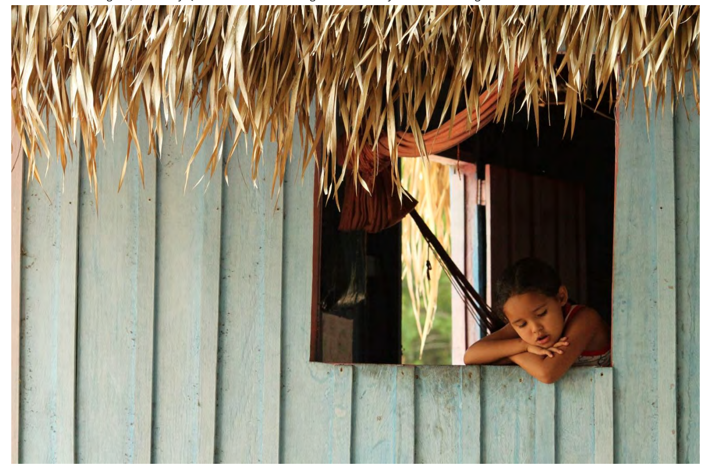
Below: A Quilombola girl in the window of a house that is very traditional and very characteristic of the region. Build on the margins of rivers, these houses are called Casa de Palafita (stilt houses) and have for centuries enabled the Quilombola to coexist harmoniously with the cycles of droughts and floods of the Amazon tributaries. But climate change, and the construction of mining dams along the river have greatly affected the river regime, and many Quilombola are now losing the homes they have lived in for generations.

In 2020, the Brazilian government approved environmental studies for the construction of a 225-kilometre transmission line across one of the most protected regions of the Amazon, part of which are within Quilombola territories.<sup>40</sup> The energy is produced at the Tucuruí hydroelectric power plant, Brazil's second-largest plant, which itself has had severe social and environmental impacts.<sup>41</sup> The communities whose livelihoods will be affected by this latest project will see none of the benefits, as the transmission line will supply other municipalities – including two that host large bauxite mines which are causing further destruction of the rainforest.<sup>42</sup>