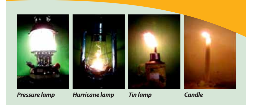
Figure 3: Fuel-based off-grid lighting technologies