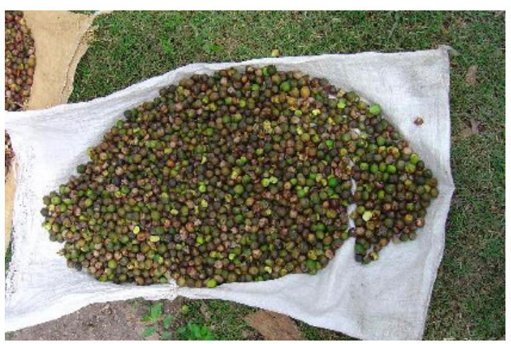
Dry Maya Nut seed can be stored for up to 5 years. This makes it an excellent food for regions with frequent drought and food insecurity.

One acre of Maya Nut forest can sequester approximately 40 tons of carbon over 20 years. For $500 per acre per year the Equilibrium Fund reforest degraded land with Maya Nut trees to offset carbon inputs, provide high quality habitat for birds and wildlife, protect vulnerable watersheds and feed impoverished families.