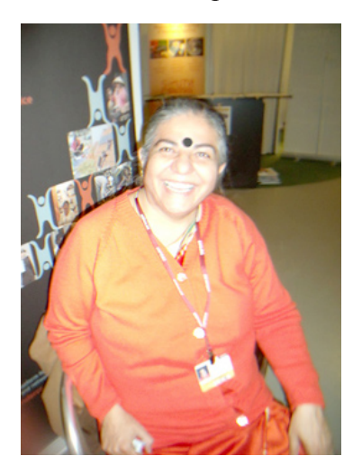
Vandana Shiva, international negotiator, outspoken and articulate proponent of ecological-feminism in the COP process

However, while the relatively small number of women present appear to have had a considerable effect on the outcomes of the negotiations, whether as part of government or NGO delegations, it is important to recognise that they have a right to be there as a matter of gender justice, regardless of whether their presence is an aid to the effectiveness of the negotiations.