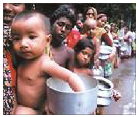
Flooding creates chaos and difficulties in every single part of life.