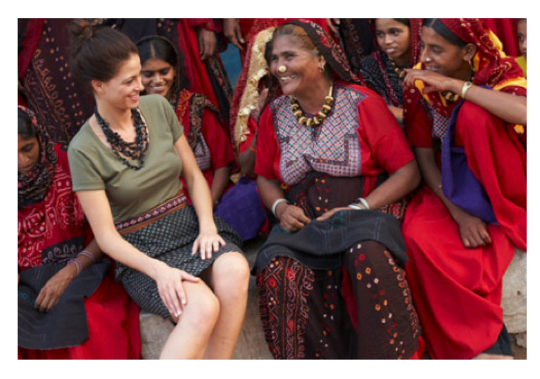
Contemporary use of traditional skills at People Tree

Inspirational groups like these are transforming lives through Fair Trade partnerships. The fact that they provide us with beautiful alpaca knits, intricately-crafted jewellery, and delicate silks is an incidental bonus.