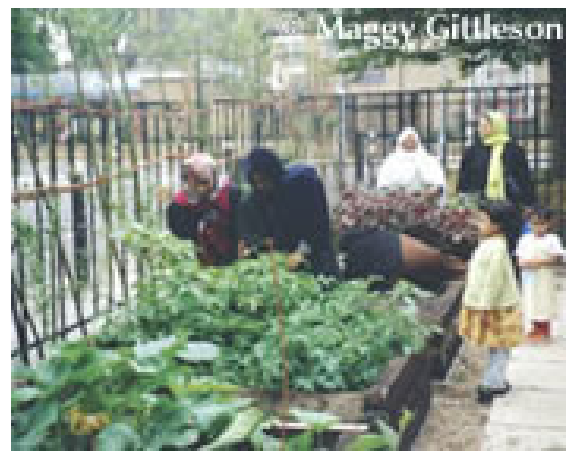
Cultivating the Future: WEN food growing campaign

Since it started, the project has set up the Taste of a Better Future national network of community food growing projects, holding popular Culture Kitchen events that allow women from different groups to come together and share their ideas and experiences whilst enjoying the shared fruits of their plots. Recently, Getting to the Roots , a new programme to train volunteers to support new and existing groups has been praised for empowering its participants with the skills, knowledge and confidence.